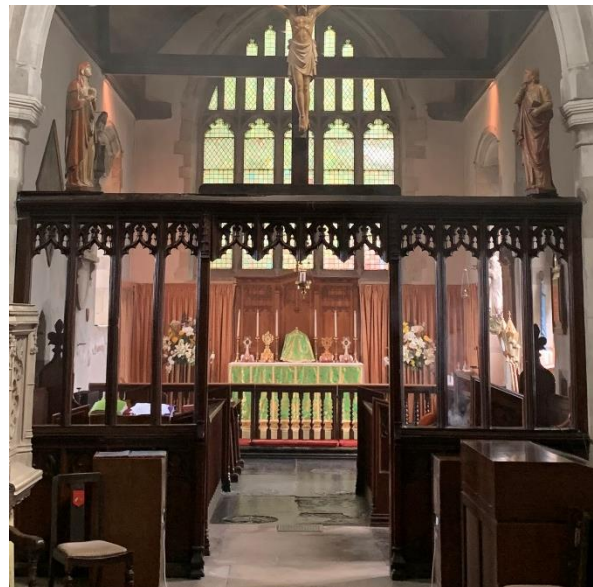
Sanctuary and High Altar Aug 2021