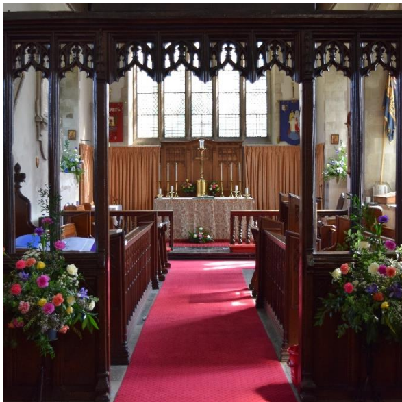
Sanctuary and High Altar Aug 2015

We already have taken steps in this direction. The outer fabric of the chancel has been extensively repaired as part of the NLHF funded restoration completed in 2019; carpeting in the sanctuary and chancel has been removed to expose and highlight historical features (this was damaging both the ledger stones and funerary brasses); redundant furniture accumulated there over the decades (e.g., spare chairs) has been relocated; the altar has been relocated against the east wall; and floors and choir stalls have been sympathetically cleaned and polished.